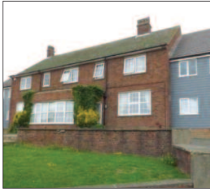
Wheelwright Court, Dover Conversion of pub to 9 apartments