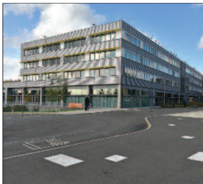
Here East, E15 Commercial