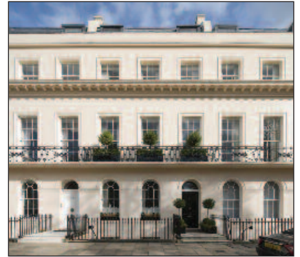
Chester Terrace NW1 Residential