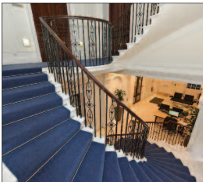
66 Grosvenor Street, W1 Commercial