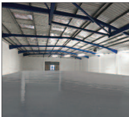
Self Storage Unit Industrial