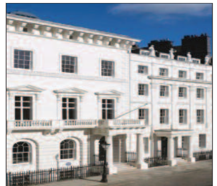
St James's Square, SW1Y Commercial