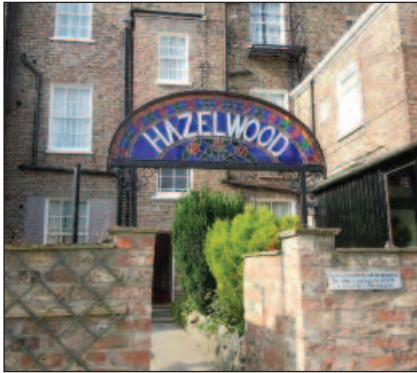
Portland Street, York Conversion of hotel to 9 apartments